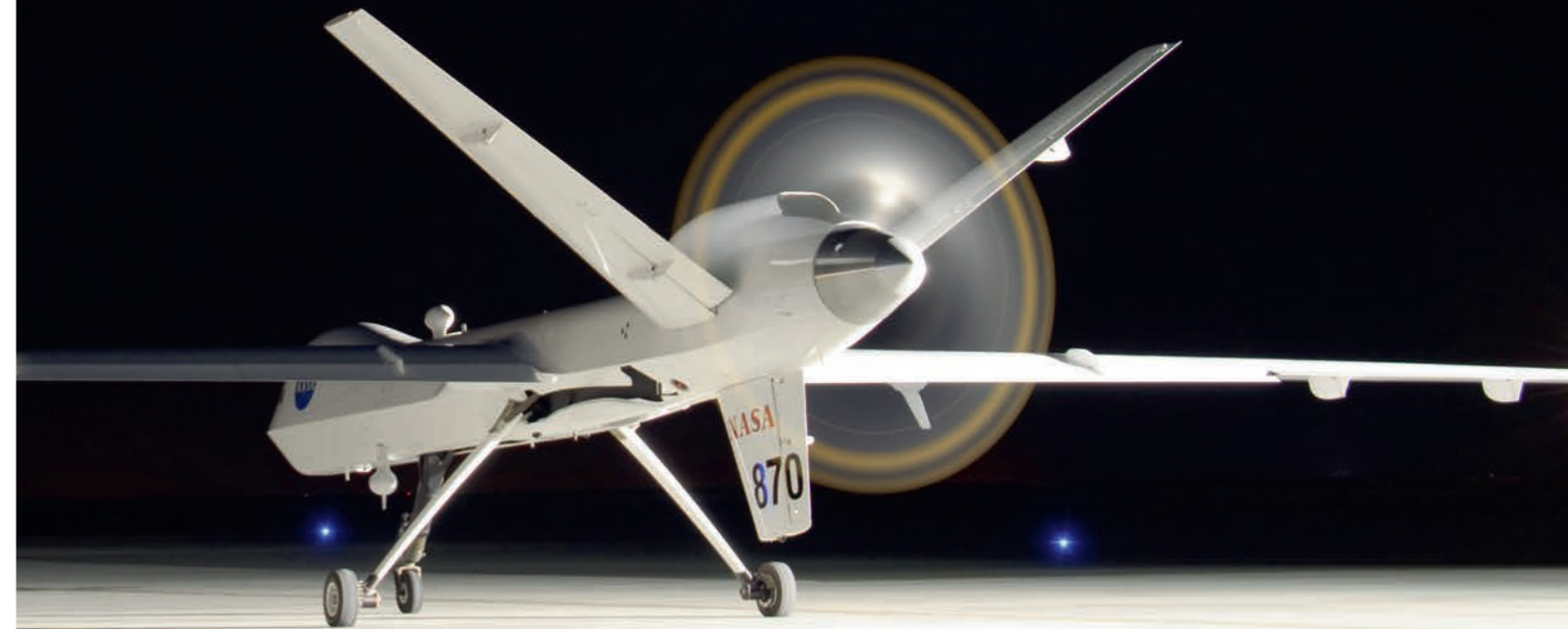
Photo: TE12 test wrap UAV, June 27, 2012 by NASA. Licensed under Creative Commons.

“The drone market has been estimated at many tens of billions of dollars and is forecast to continue to grow significantly over the next decade. It is important that standards are developed to protect and support this potential.”